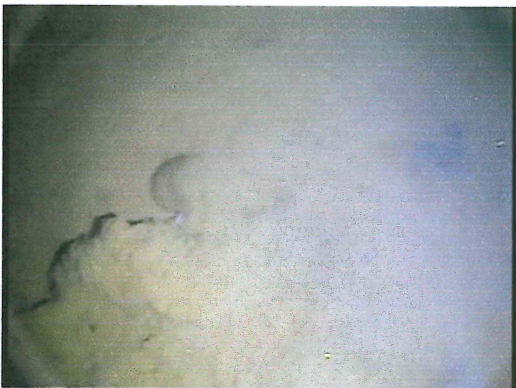
Before vacuuming tank, heavy sediment