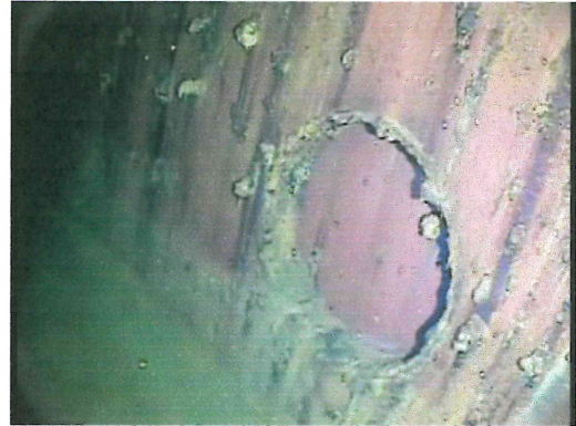
Rust in tank