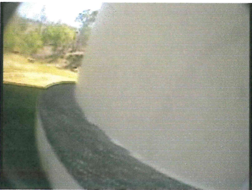
Outside of tank-Good Condition