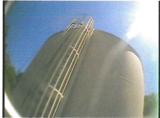
Outside of tank-Good Condition