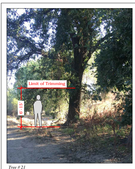
Tree # 21 Typical Tree Trimming Detail Not to Scale

Note : Trees will be trimmed to provide pedestran clearance 9' above finished grade