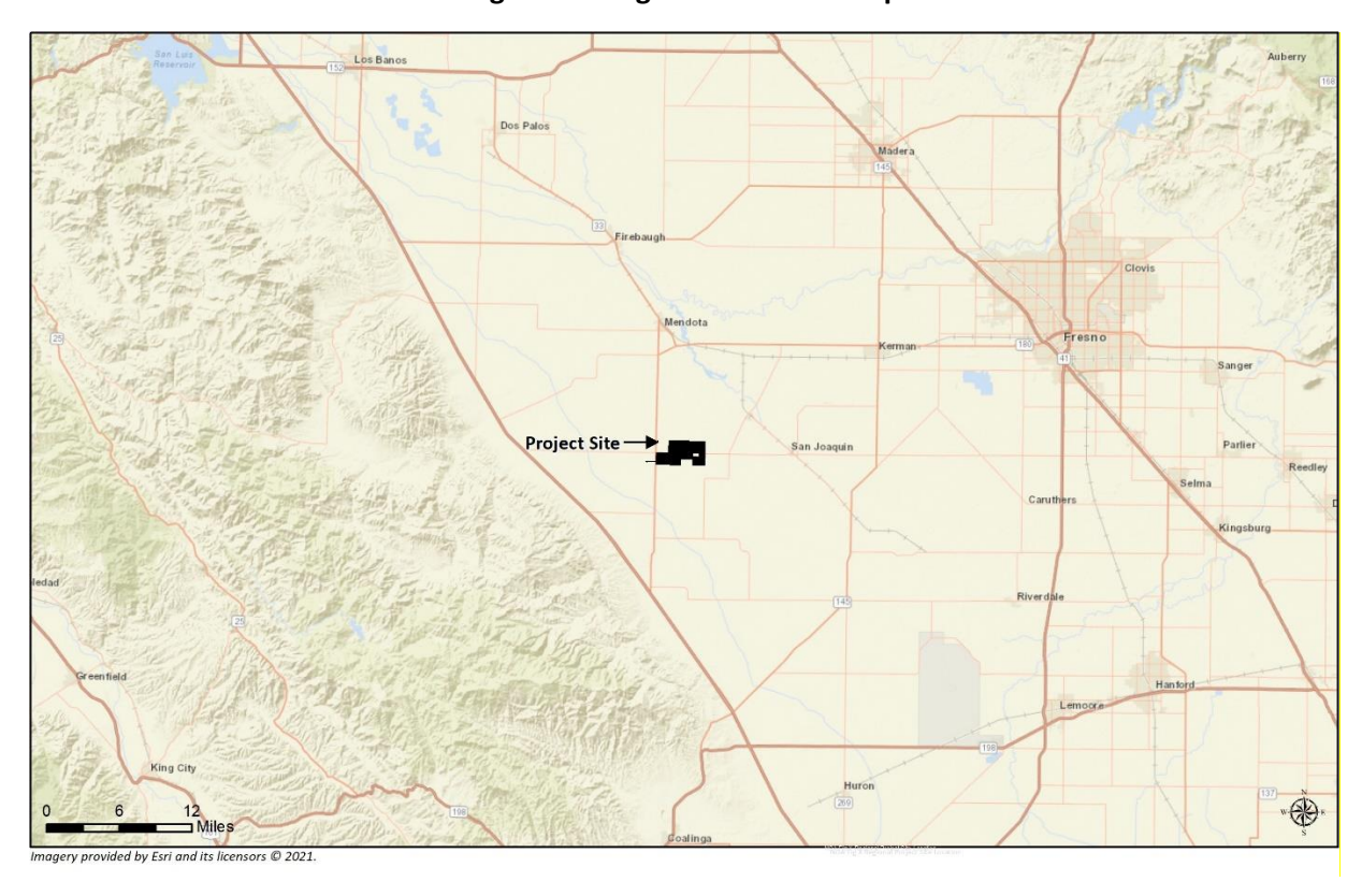
Figure 2 – Project Vicinity Map