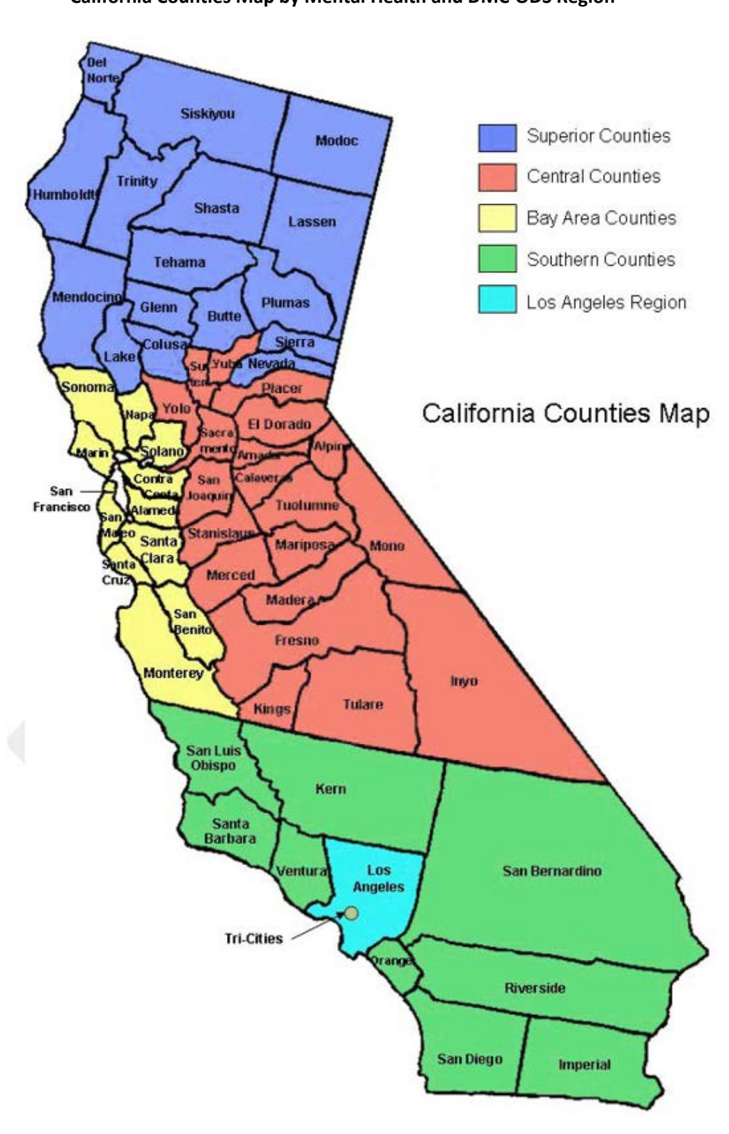
Attachment F California Counties Map by Mental Health and DMC-ODS Region